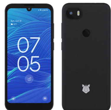
RHINO C6 used by VeeOne Health.

Rhino Mobility's RHINO C6 powered CravAlert with secure, always-connected hardware, helping VeeOne Health and partners deliver lifesaving addiction recovery support.